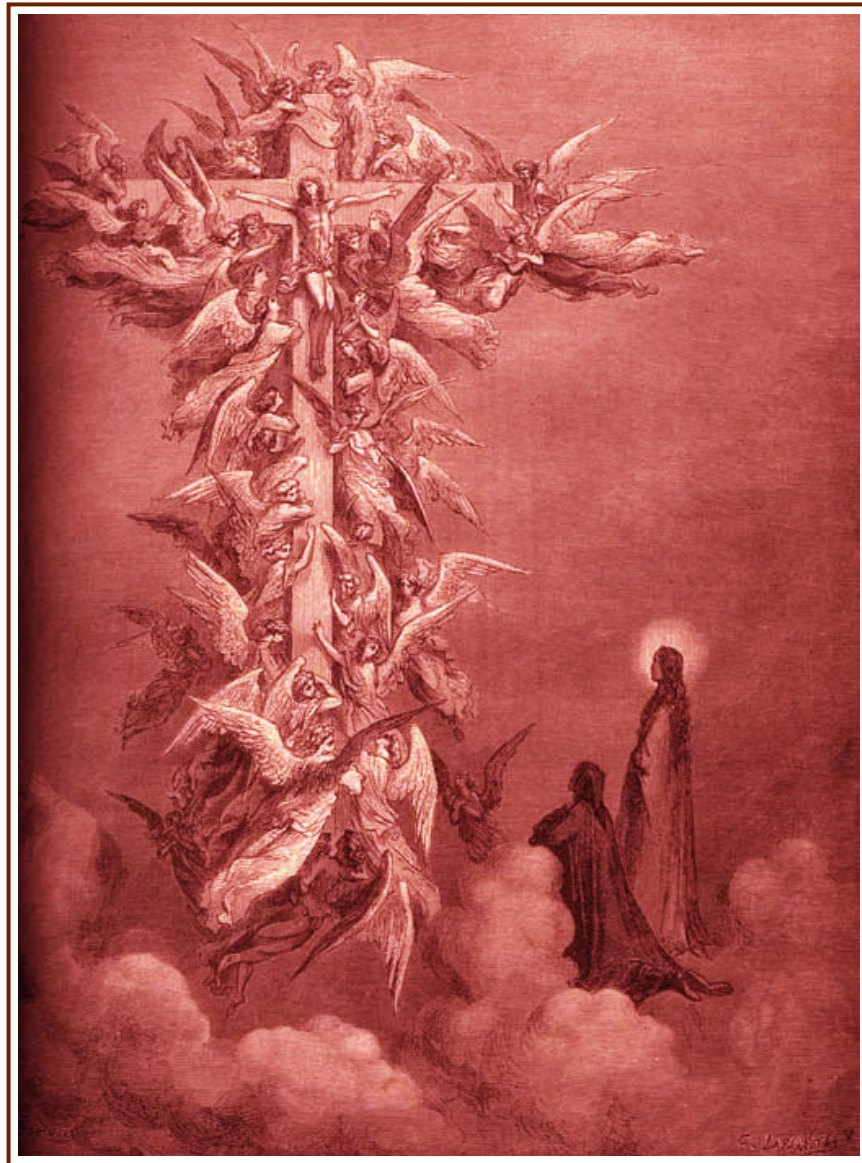
Dante's Rosicrucian Esotericism