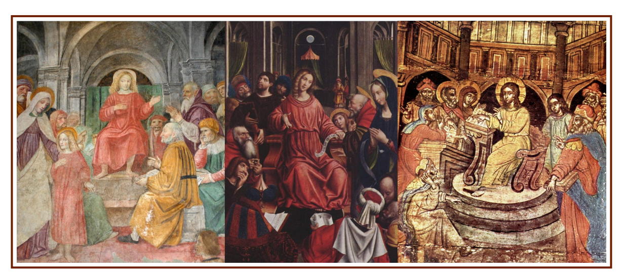
Schema FMC00.098 shows various pictures of the scene in the temple at age 12 by Ambrogio Bergognone, Defedente Ferrari, and a greek icon.