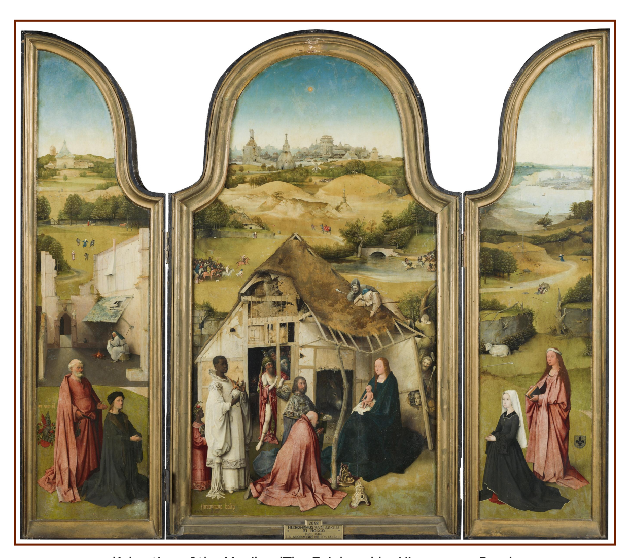
'Adoration of the Magi' or 'The Epiphany' by Hieronymus Bosch