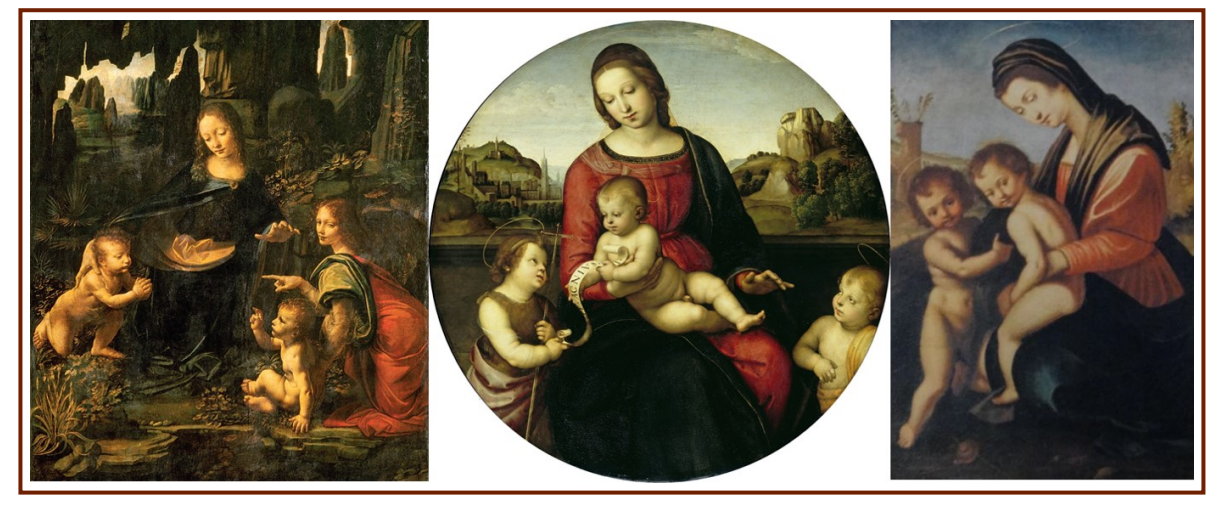
Schema FMC00.098 shows paintings by Da Vinci (left), Raphael's Madonna del Duca di Terranuova (middle), and a work by an unknown painter (photograph by the editor in a church in Italy).