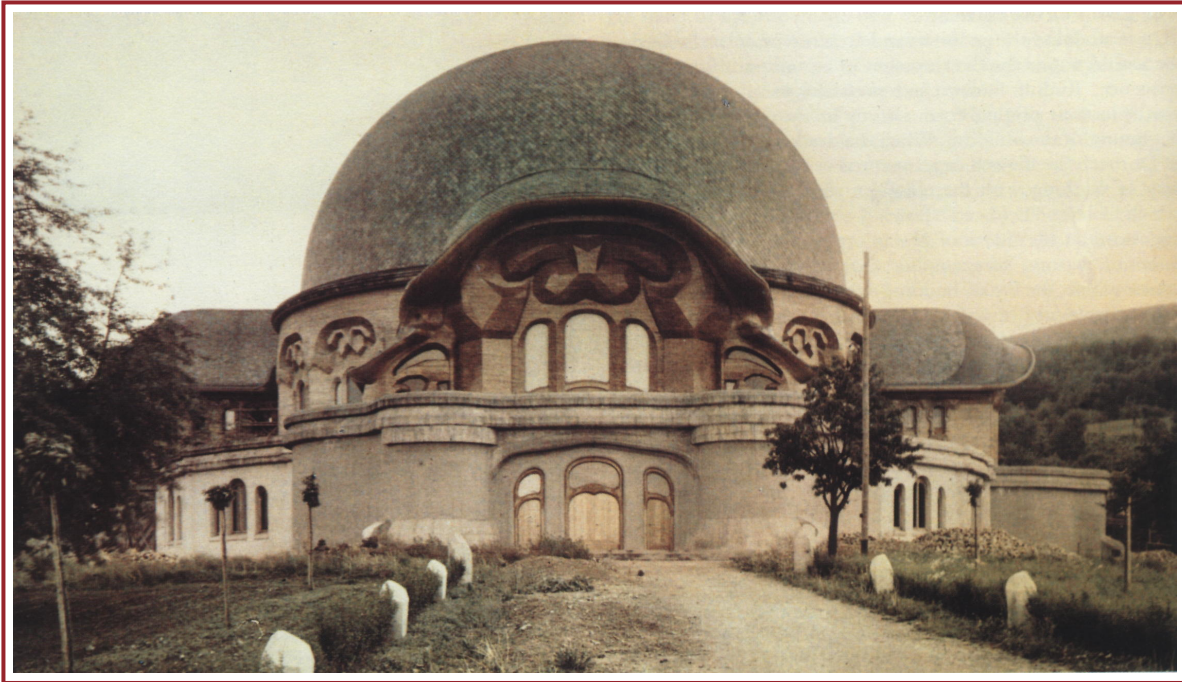
The First Goetheanum before being burned down. The entire upper portion of the structure was constructed of wood.