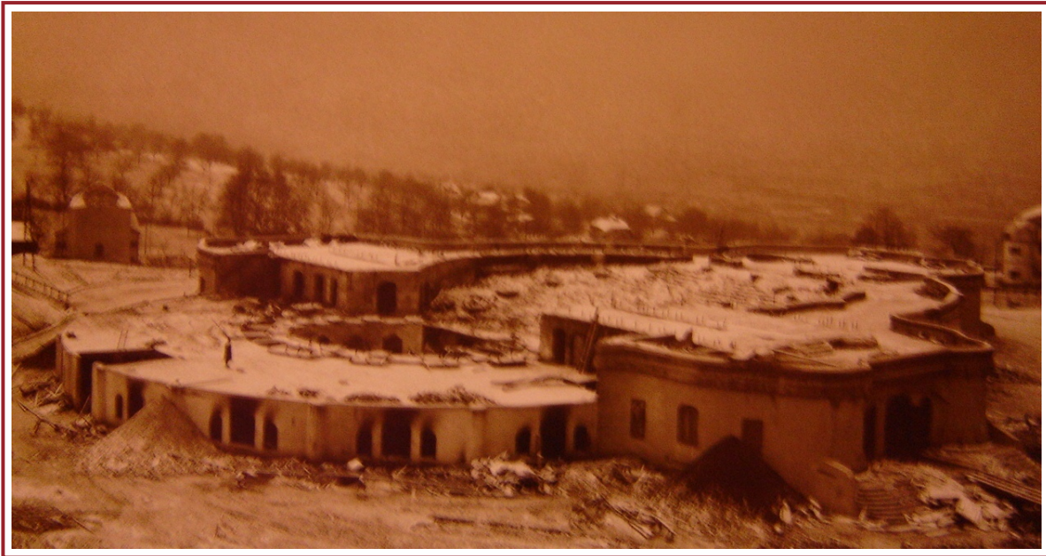
The First Goetheanum the morning of January 1, 1923