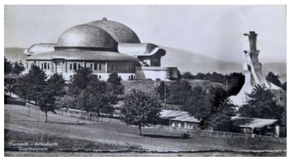
Figure 2. Rear view of the Goetheanum with Heizhaus to the right (postcard)

Rudolf Steiner wanted the art of the Goetheanum to speak directly to the viewer without intermediary explanations: "Sometimes I had occasion to show visitors the Goetheanum personally. Then I used to say that all 'explanation' of the forms and colours was in fact distasteful to me. Art does not want to be brought home to us through thoughts, but should rather be received in the immediate sight and feeling of it" [1: 3]. The photographs in the present paper offer an insight into the experience of Steiner's visitors (Figs. 1, 2 & 3).