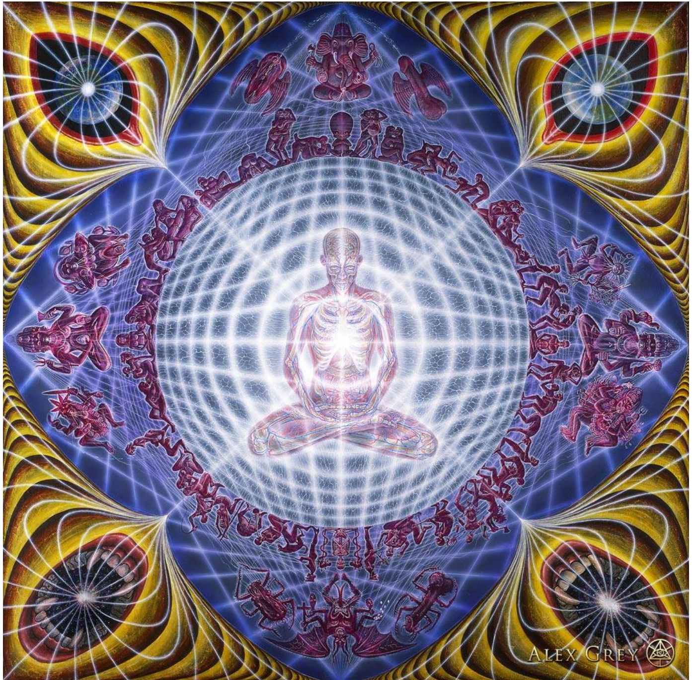
Art by Alex Grey: Demons and Deities draining from the Milky Pool (feeding off sexual energy)

- Eve Lorgen ( http://evelorgen.com/wp/ ), The Dark Side of Cupid