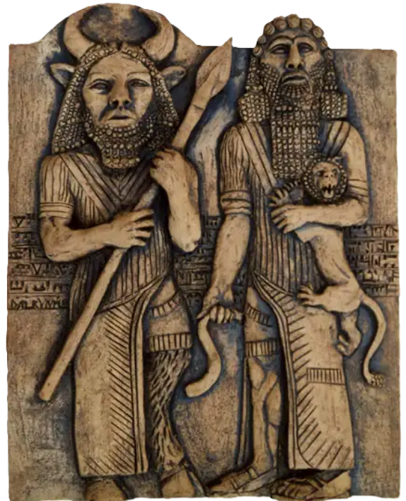
Enkidu & Gilgamesh