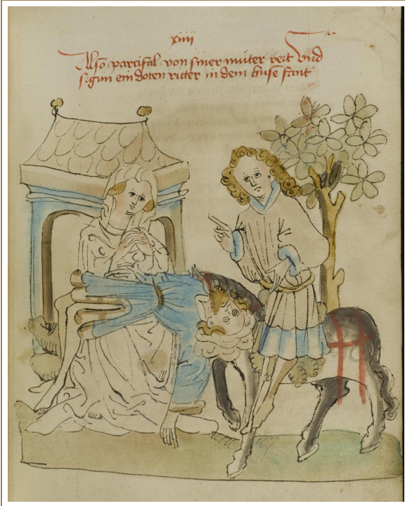
Parzival meets Sigune, the dead Schionatulander across her lap