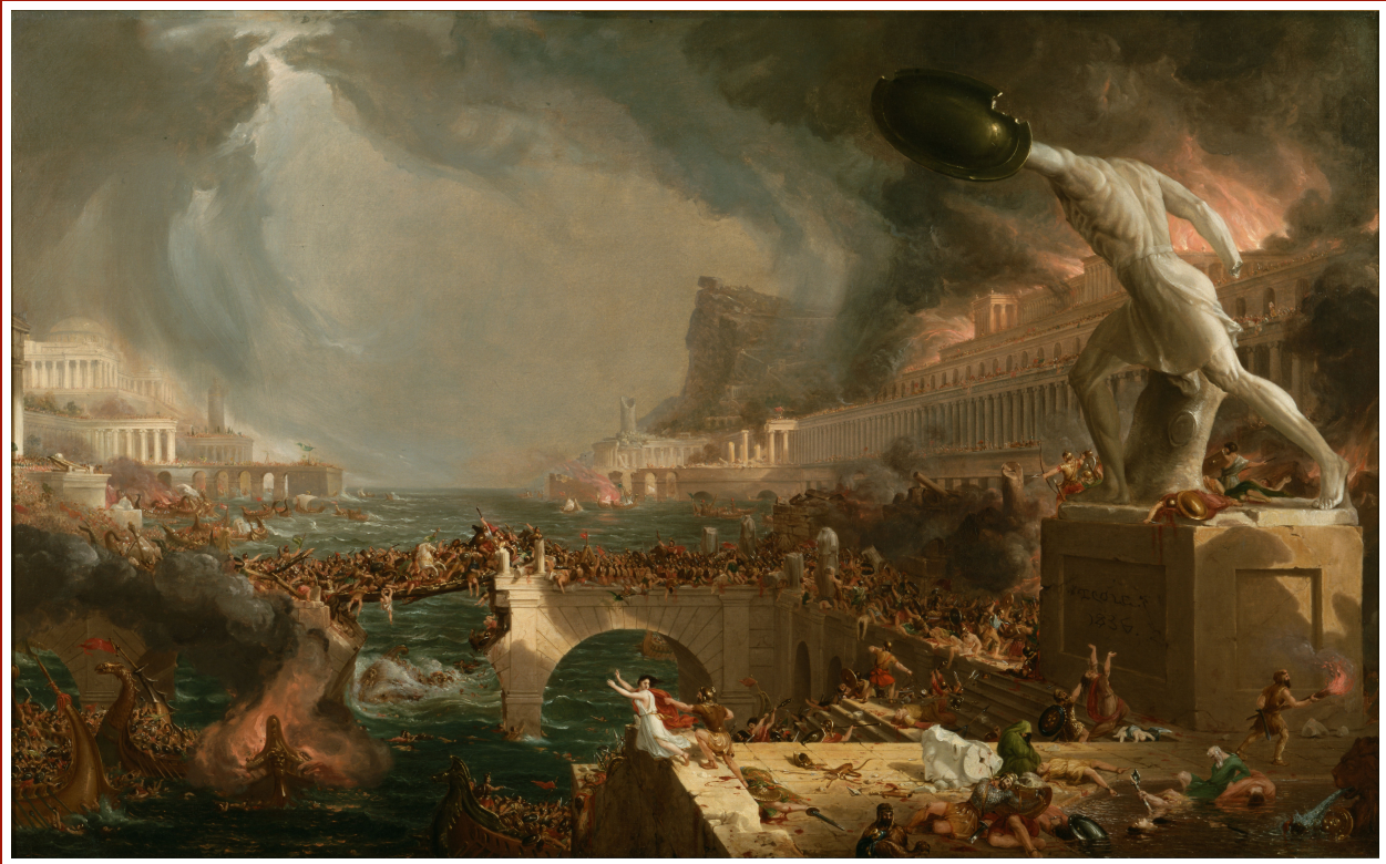
Cole Thomas, The Course of Empire Destruction, 1836

Sources: https://anthroposophy.eu/Future_Oriphiel_age & https://anthroposophy.eu/Nostradamus